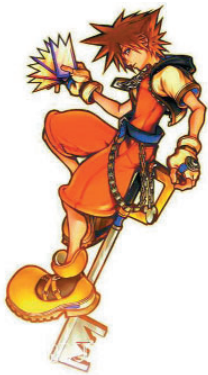
(Not Actual Card Image)

PRESENTATION [8]: For those of you not familiar with the property, Kingdom Hearts is a series of videogames based on Final Fantasy and Disney characters battling together to save their worlds. The first set is just Disney characters and the art is up to par with Disney standards. This game is a direct translation of the Japanese game, and only the border color was changed. The starters include a playmat, rulebook, and a DVD to teach you how to play.